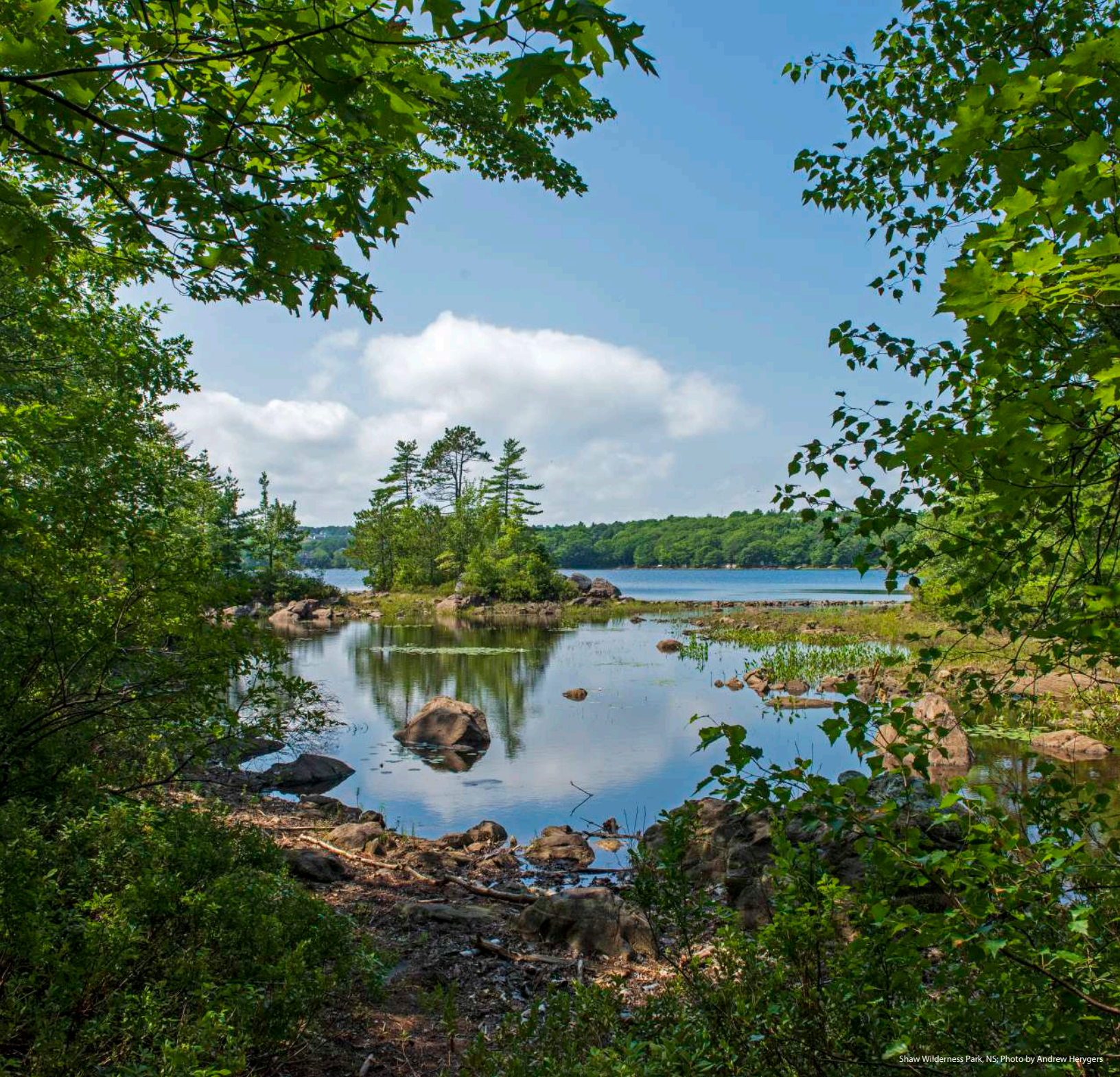
Shaw Wilderness Park, NS